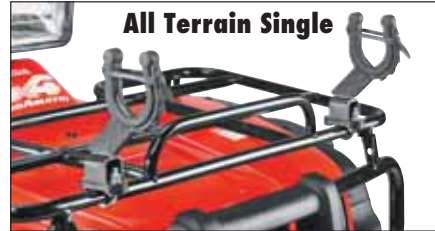
All Terrain Single