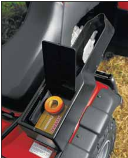
Plastic Mount Storage Compartment