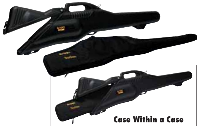
Case Within a Case