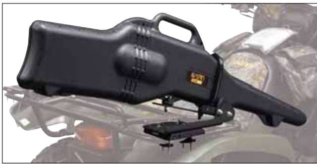
Real Tree Hardwood