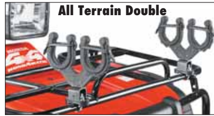
All Terrain Double