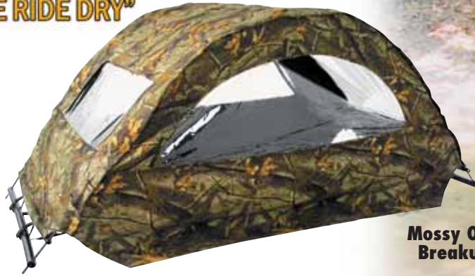
Mossy Oak Breakup